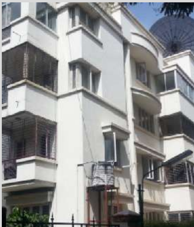
Fair Haven Apartments , St. John's Road, Bangalore